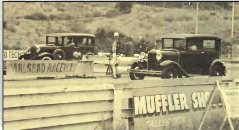
Antique Drag Racing - May, 1988

Upwards of 80 members come to OCMAFC monthly meetings.