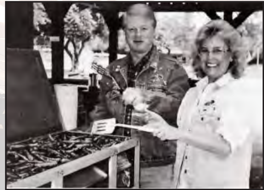
Look at all that Sausage!