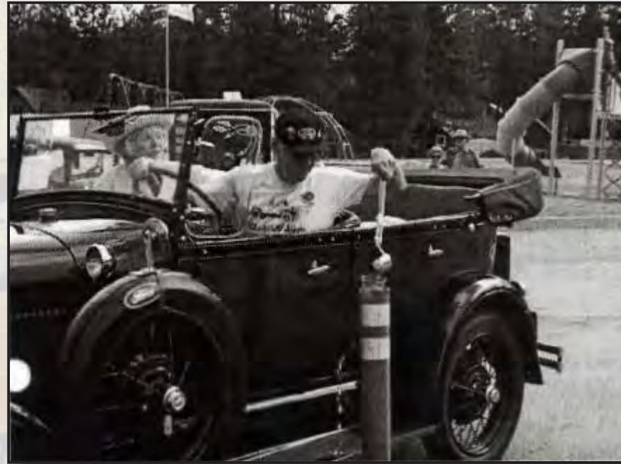
The Distributor October, 1999