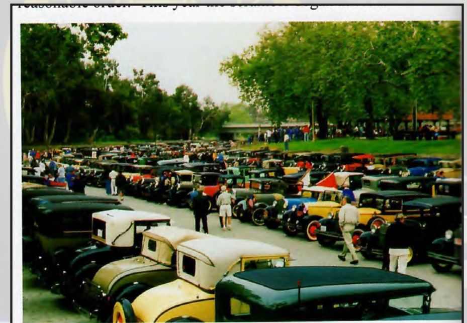
Every conceivable body style and color combination of