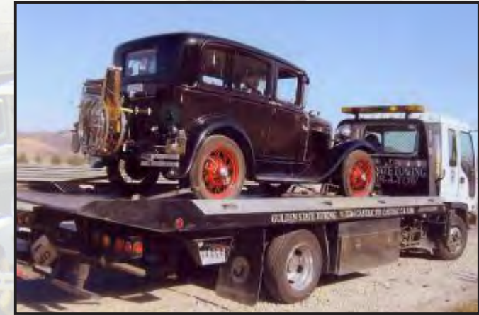
The Distributor June, 2007

Announced: No freeway driving for day tours