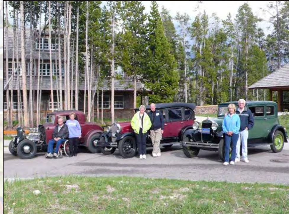
The Distributor July, 2007

20 members and 5 Model A's to CCRG in Yosemite (Tenaya Lodge)