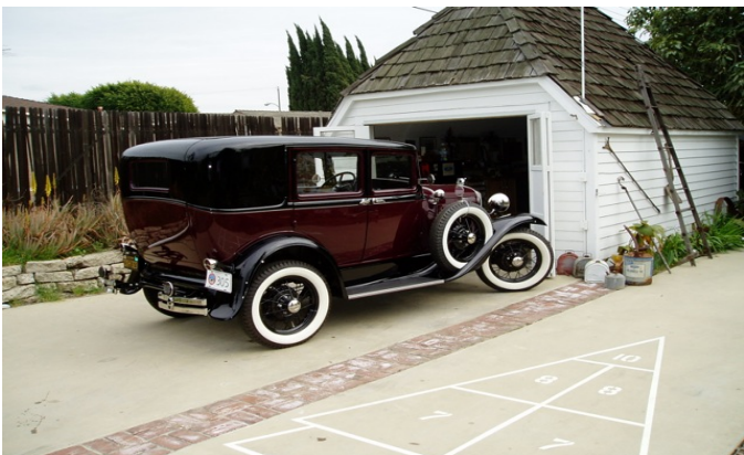
160 C DeLuxe Fordor “Blindback” exterior Featured Model