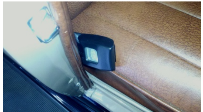
1931 Roadster fixed outboard buckle

Prior planning and fitting of all parts before cutting, drilling or welding is key to getting ultra clean and fully functional results like these. Seat belt anchor points must withstand very substantial forces in the event of even a minor collision. The Model A was never designed for crash worthiness. Carefully inspect all flooring, body braces, rockers and frame components for rust through, rotted wood and overall structural integrity. Repair or replace any components that are not 100% up to the task.