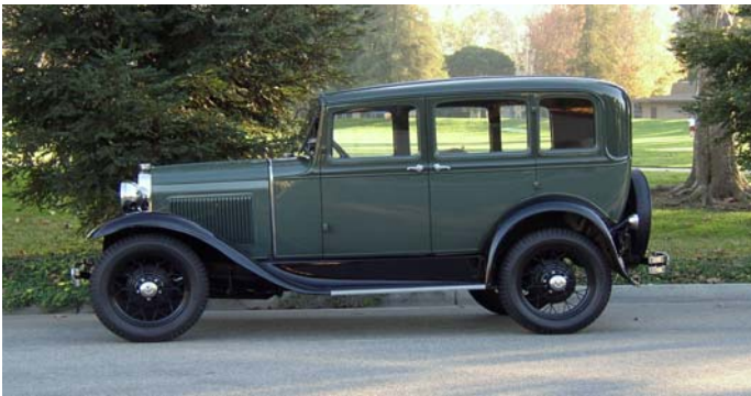
160 A Standard Sedan exterior