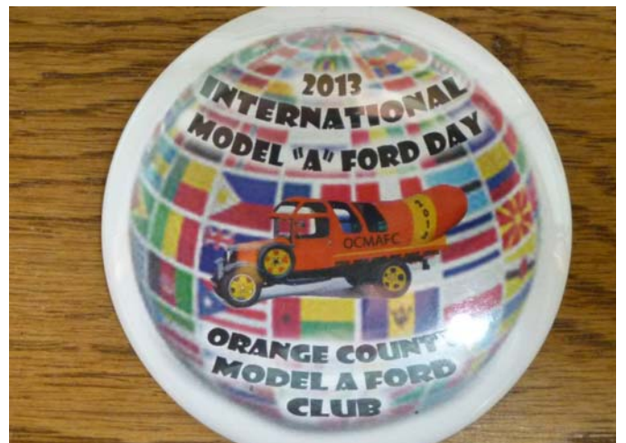
International Model A Ford Day