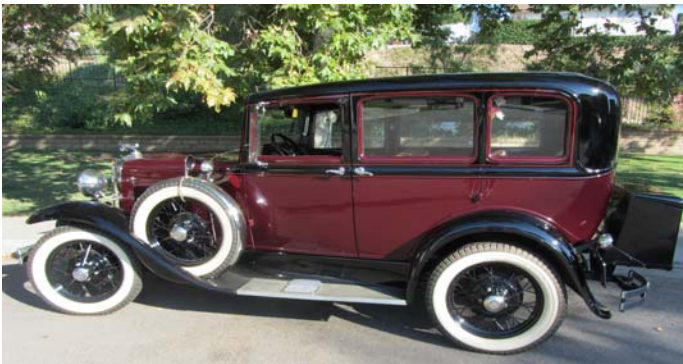
160 B Town Sedan exterior