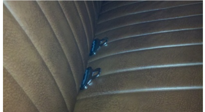
1931 Roadster retractable center belts

As seen in the following photos the retractors are virtually hidden and the fixed buckle portion is easily accessible but tucked neatly out of sight.