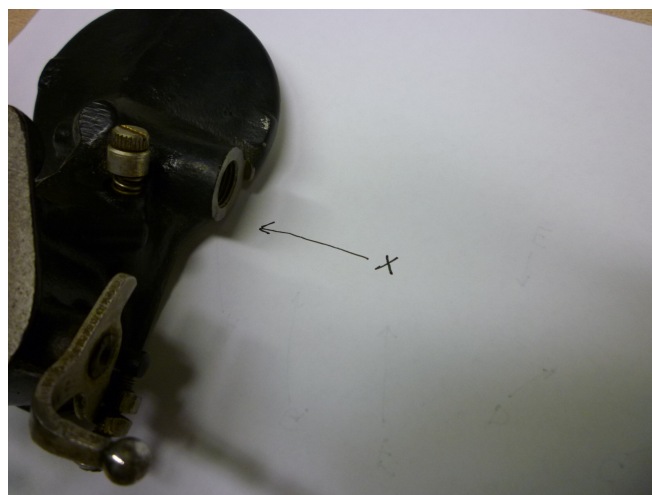
Side bowl carburetor top casting

The two surfaces at "A" and "B" must be flat and parallel to each other. The surface at "C" (under the head of the hex) must be flat and perpendicular to the length of the bolt. The flange at "D" must not be excessively long such that it binds against the inside of the casting. The length of the threads at "E" should not be excessively long such that they bottom out inside the carburetor boss. The screen at "F" should not be excessively long such that it binds inside the casting. The gaskets at "G" and "H" are what seals off any fuel leak.